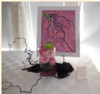
Lynn Fordham—Creative and Colorful